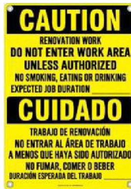
Figure 4: Example Signage