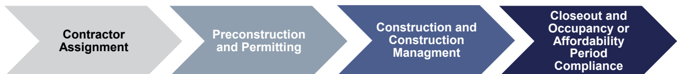
Figure 3: Construction and Compliance

The construction and compliance phase, as seen in Figure 3, is where repair, reconstruction, or replacement assistance is provided to the property owner through direct construction activities performed by the program and the result is a rehabilitated housing unit. After final construction activities and the completion of any compliance period, the grant will be closed out – meaning that all required documentation for HUD compliance and record-keeping will be completed.