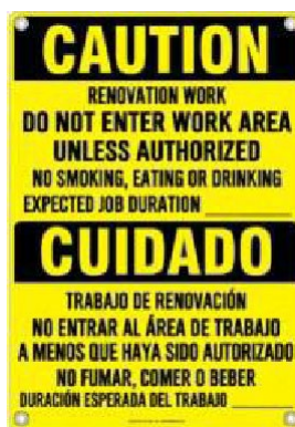
Figure 4: Example Signage