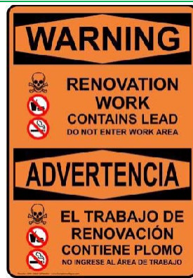
Figure 5: Example Signage

If site conditions are noncompliant, a stop work order will be issued until all problems are resolved and verified by program staff. The time the project is on hold will be included when calculating construction duration and is considered the fault of the contractor and subject to performance penalties. Any issuance of a stop work order will also be taken into consideration when determining future assignments and participation in future projects.