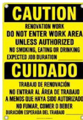
Figure 4: Example Signage