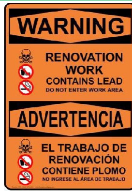
Figure 5: Example Signage

If site conditions are noncompliant, a stop work order will be issued until all problems are resolved and verified by program staff. The time the project is on hold will be included when calculating construction duration and is considered the fault of the contractor and subject to performance penalties. Any issuance of a stop work order will also be taken into consideration when determining future assignments and participation in future projects.