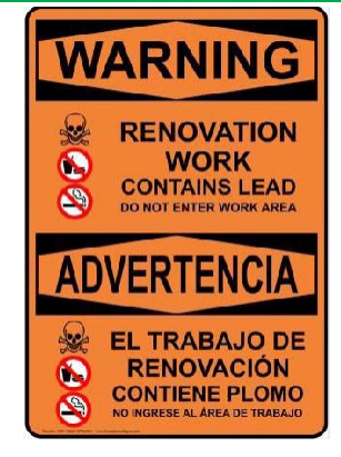
Figure 5: Example Signage

Housing Repair and Replacement Program Guidelines for Hurricane lan